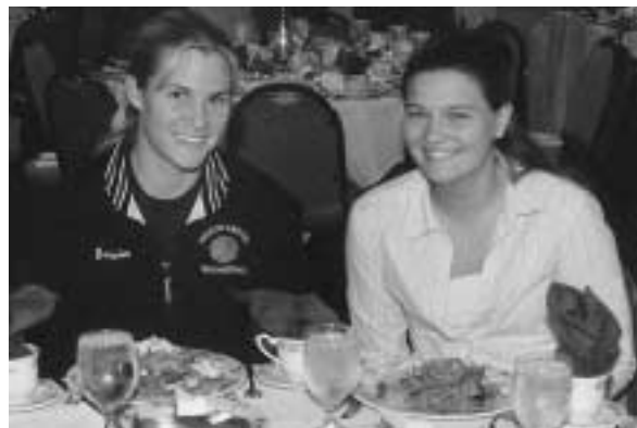
Members of Southern New Hampshire University's Business & Honors Class came to the conference to hear Barbara Ehrenreich speak about her book Nickel and Dimed , which is required reading for their course work.