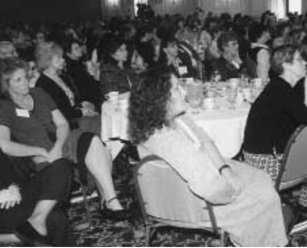
People came from throughout New Hampshire to participate in financial education.