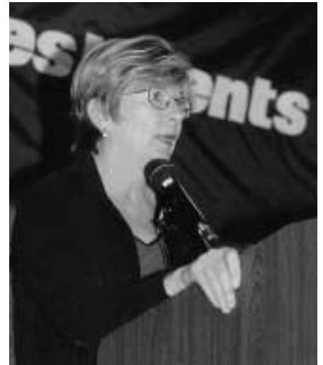
Barbara Ehrenreich speaks about barriers to women's economic self-sufficiency.

"I will never use the words 'unskilled labor' to describe anyone working in a low-wage job," said Ehrenreich.