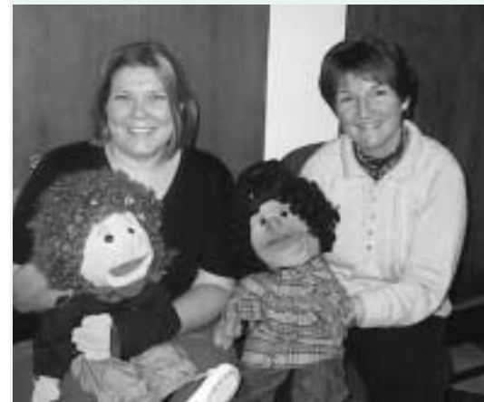
Educators at Sexual Assault Support Services in Portsmouth use puppets to help teach children about abuse.