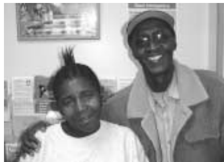
The Way Home in Manchester supports refugee families with ESL classes, cooking classes, and other assimilation programs.

To educate refugee women about tenancy, budgeting, health, and hazardous environmental issues to help prevent the loss of housing and protect families from health issues.