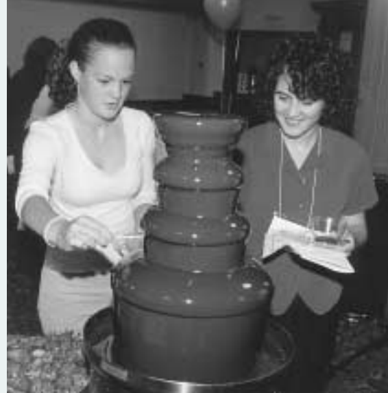
Dipping strawberries in the scrumptious chocolate fountain at the 2004 Recipe for Change

Join the fun and support the work of the Women's Fund!