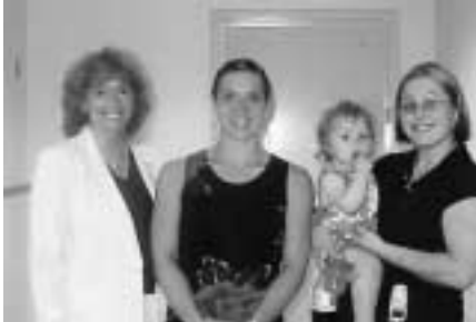
Odyssey Family Center staff pose proudly with two graduates of the Canterbury, NH program.

To provide treatment programs for women suffering from substance abuse, assisting them on their way back to self-sufficiency.