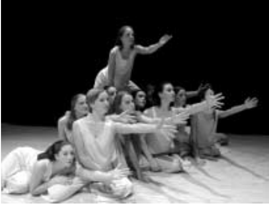
At the Moving Company Dance Center in Keene, girls participate in multi-arts summer programs that build self-esteem and help develop important life skills.