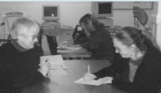
VNA Manchester offers vital educational support and assistance to women preparing for their G.E.D. test.

The Grantee Partners selected in 2004 are those organizations that demonstrated most successfully their commitment to social change. The Women's Fund received grant applications requesting nearly $250,000 in support from 57 organizations across the state. We are pleased to announce the following awards totaling $45,000 to 18 organizations. The programs and expertise of these nonprofits will truly effect social change in New Hampshire and further the goal of enabling all women and girls to reach their full potential.