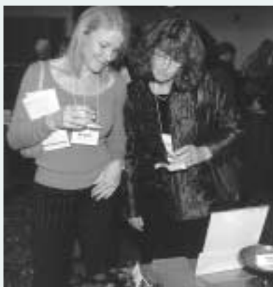
Admiring some fabulous auction items!

Thank you to these Generous Sponsors of WFNH Programs